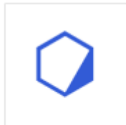
Tonality Word Add In Setup 0.5.1.exe

Double click the installation file "TonalityTech.exe" and follow the instructions; restart Word and enter the License credentials